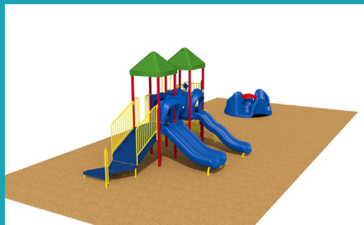
* Playground images shown may not accurately reflect the final project.